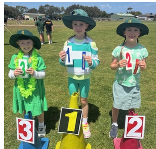
Yr 1 Girls