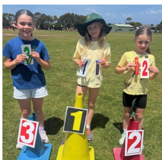
Yr 2 Girls