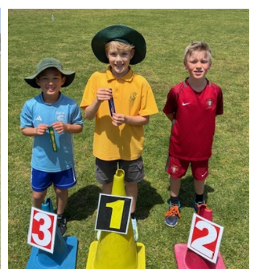
Yr 2 Boys