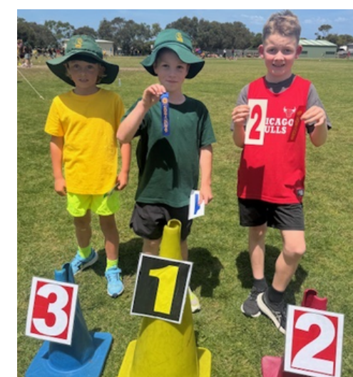
Yr 1 Boys